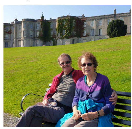
Plas Newydd - Anglesey 2022